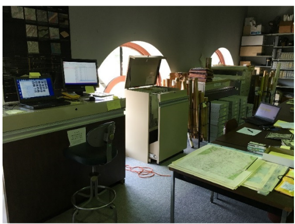
Figure 4. View of workstation used for secondary database QA/QC.