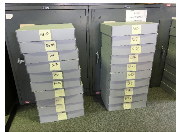
Figure 5. View of a subset of archival dropfront boxes with temporary Post-It labels. Final labels were affixed at the end of the boxing effort.