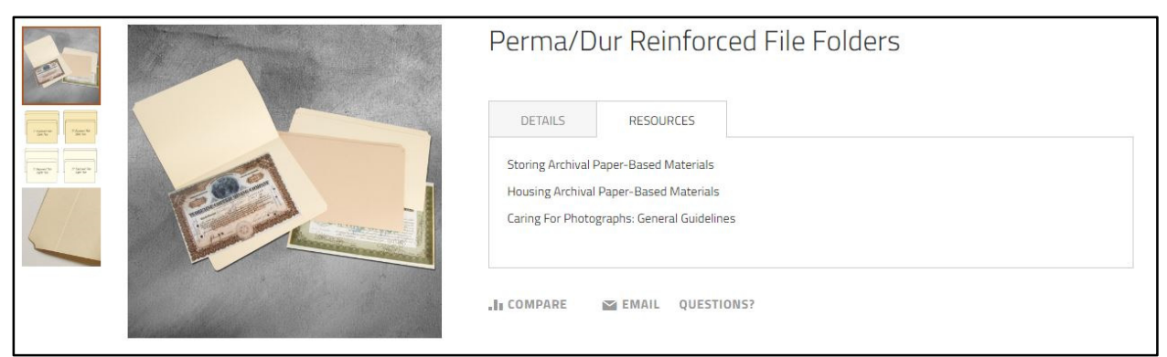
Figure 1. Image of Perma/Dur Reinforced File Folders from the University Products website.