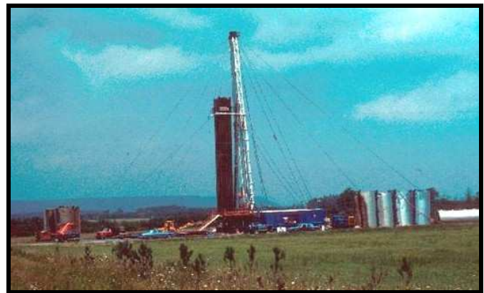
Conventional gas well, drilling about 8,000 feet in West Virginia, near the southwestern corner of Garrett County, Md.