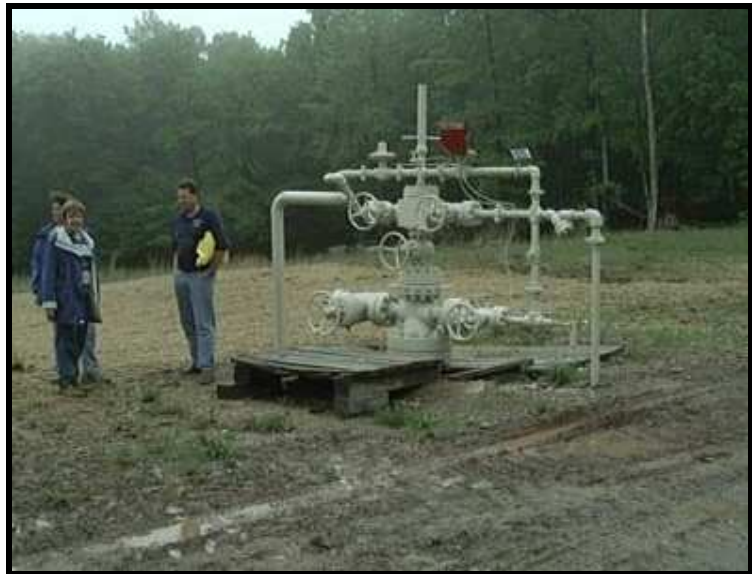
Appearance of a producing gas well in Allegany County, Maryland, showing limited environmental impact (about the same as home construction).

Mineral rights, leasing, and related matters do not fall within the purview of either the Maryland Geological Survey in DNR or the Minerals, Oil & Gas Division in MDE, but both have received many inquiries from the public. Therefore, in an effort to provide answers to basic questions about such things, we are providing links to several informative websites (below). Although their focus is on Pennsylvania and West Virginia, the generalities and principles should be helpful to the average citizen and land owner in Garrett and Allegany Counties, Maryland.